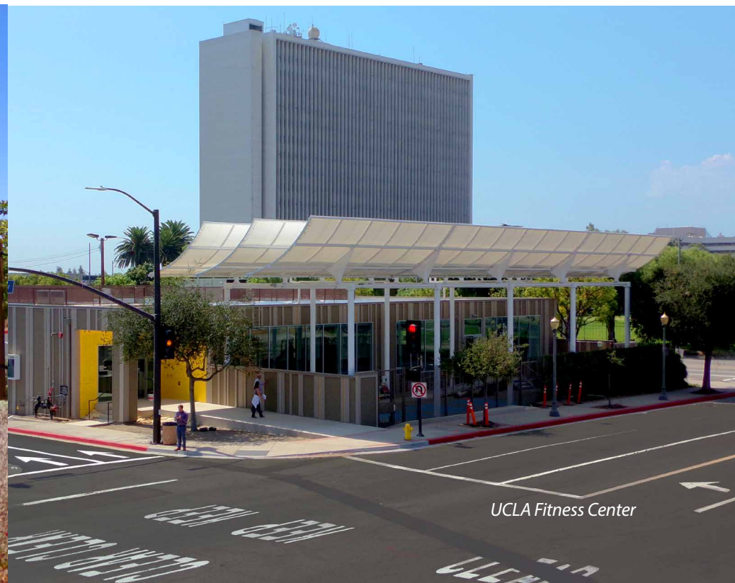
UCLA Fitness Center