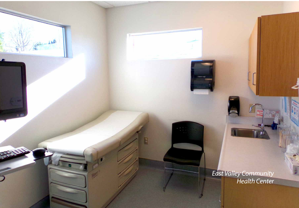
East Valley Community Health Center