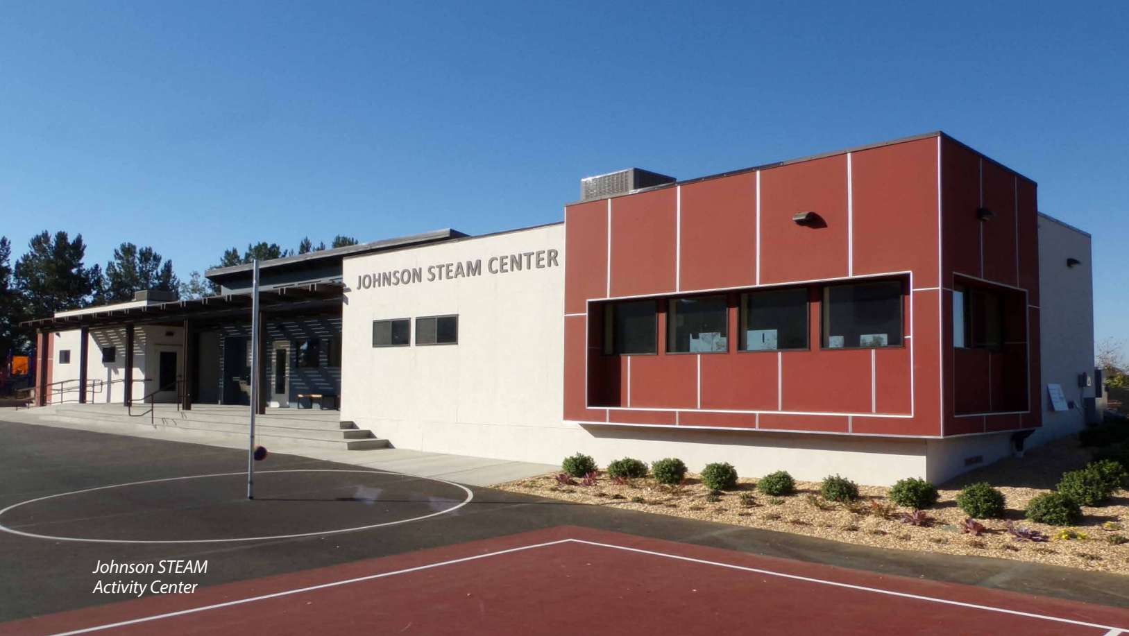
Johnson STEAM Activity Center

As one of the largest providers of modular buildings in the U.S., Mobile Modular offers a comprehensive portfolio of modular solutions for your next project.