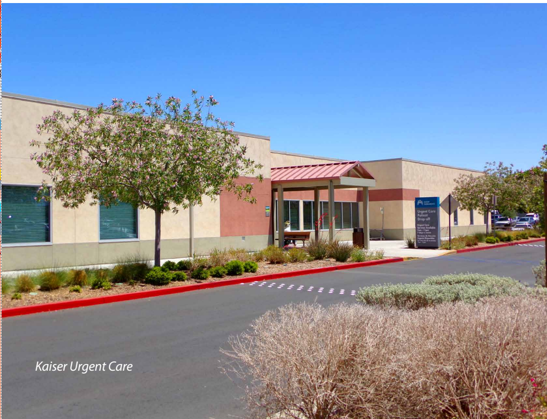
Kaiser Urgent Care