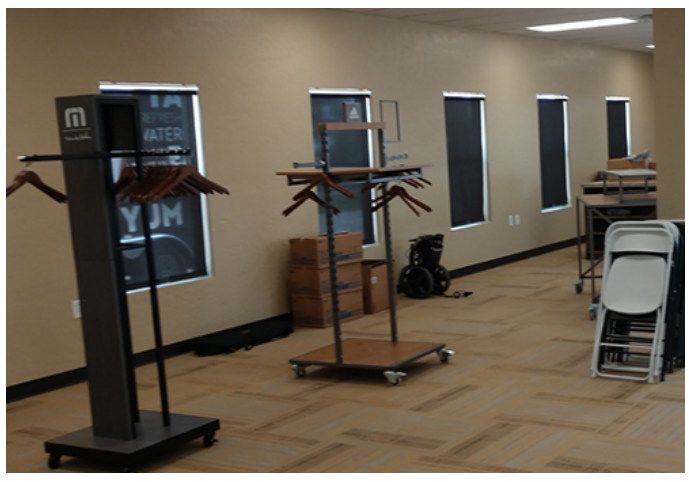
**Photos are not representative of specific asset, they are example only