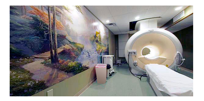
Customer Name:Mecosta County Medical CenterProject Location:Big Rapids, MIBuilding Type(s):Modular HealthcareJob Type:PermanentTotal Sq. Ft:725 sq. ft.

Mecosta County Medical Center (MCMC) was utilizing a mobile MRI that attached to a loading bay adjacent to the imaging wing of the medical center. Due to increases in physician utilization and patient volume, Mecosta believed that an upgrade to a fixed, in-house unit was in the best interest of their patients. After the State of Michigan granted the Certificate of Need for the permanent unit, MCMC faced a difficult project, due to site restrictions and budget constraints. The design had to maintain a cohesive architectural aesthetic with the existing campus, the placement had to fit within the available footprint, and the construction had to be carried out in a manner that did not disrupt daily medical operations.